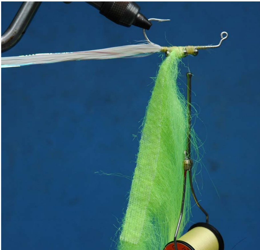
Step 3: Tying on a strip of Craft Fur (substitute Bunny Strip or Marabou if you want)