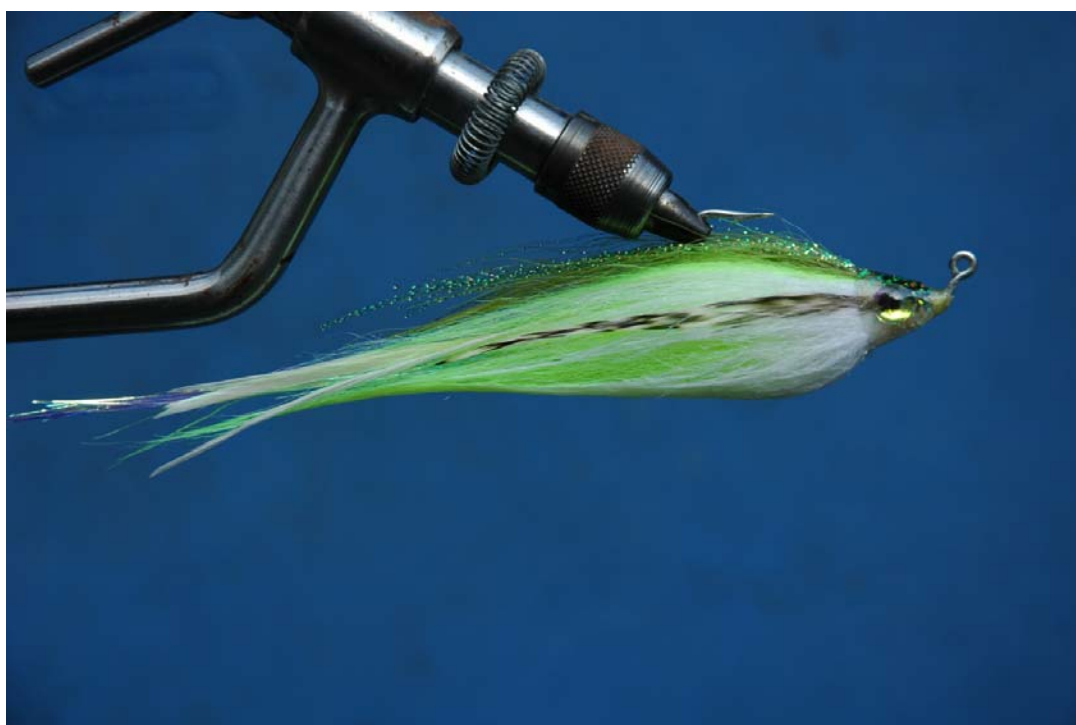
Step 7: Finish with STIFF mylar tubing head, molded eyes and epoxy