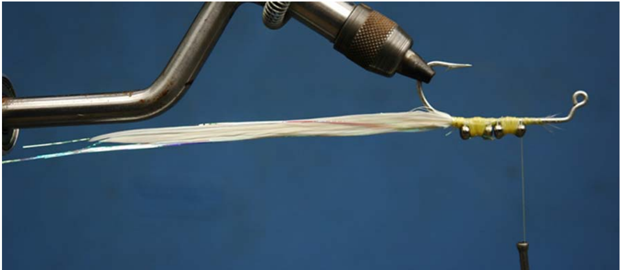
Step 2: tying in the Deceiver hackles and flash tail