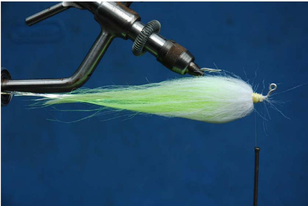
Step 5: Tying on bucktail top