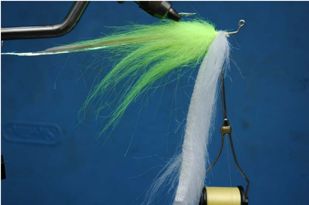
Step 4: Tying in more Craft Fur for second color