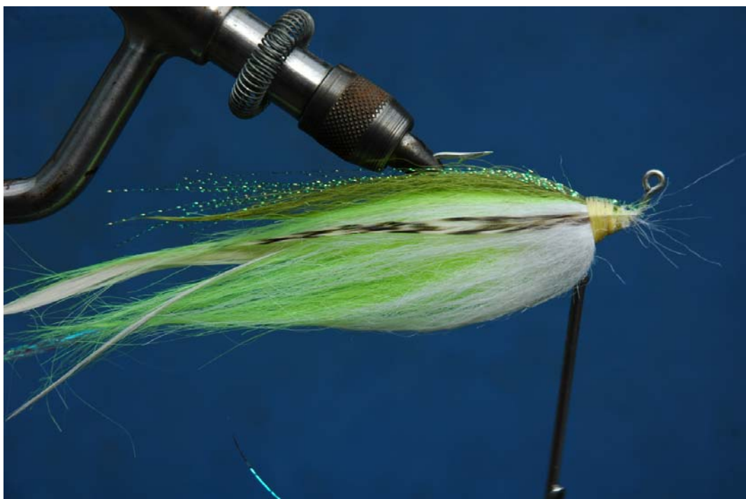
Step 6: Tying in crystal flash topping and grizzly hackle flank